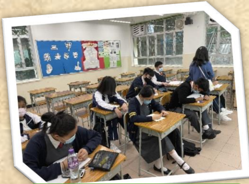
Students focus on the lesson and try to do their work.

Our school believes the acquisition of Chinese language is a basic life skill students need to be equipped with in order to survive in Hong Kong. Hence, a professional tutor is hired to help students build a solid foundation. During the class, students practised writing Chinese sentences with the help of the tutor. The interaction has been fruitful all year long.