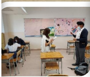
They look so confident performing the poem!