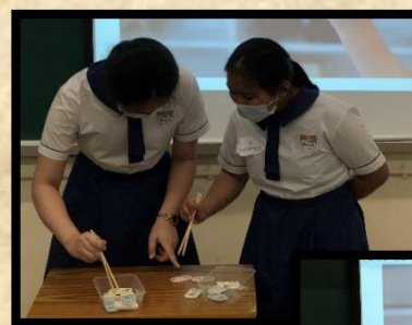
It seems they are having trouble picking up the papers with chopsticks!

Being a huge part of the Chinese culinary culture, chopsticks are this year's theme in the Chinese lesson of the Bridging Course. After learning about the history of chopsticks, students got to have some hand-on practice to master the art of chopsticks. Despite the difficult time when everyone wears a mask, they had fun learning.