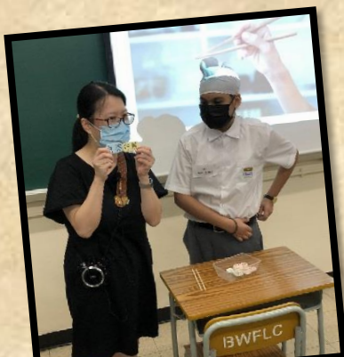
Teacher is talking about the rule of the chopstick game.

Eager to learn is one of the Fung Ling Spirits we want to pass on to our students. The S.1 Bridging Course is our attempt to introduce this spirit to the new comers. The course is designed to not only help them adapt to the new environment they will be exposed to in the next 6 years, but also teach them about the Chinese culture. We believe understanding the local culture could help pave their way in Hong Kong.