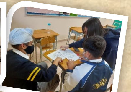
Teachers are teaching them how to pronoun the Chinese characters accurately.